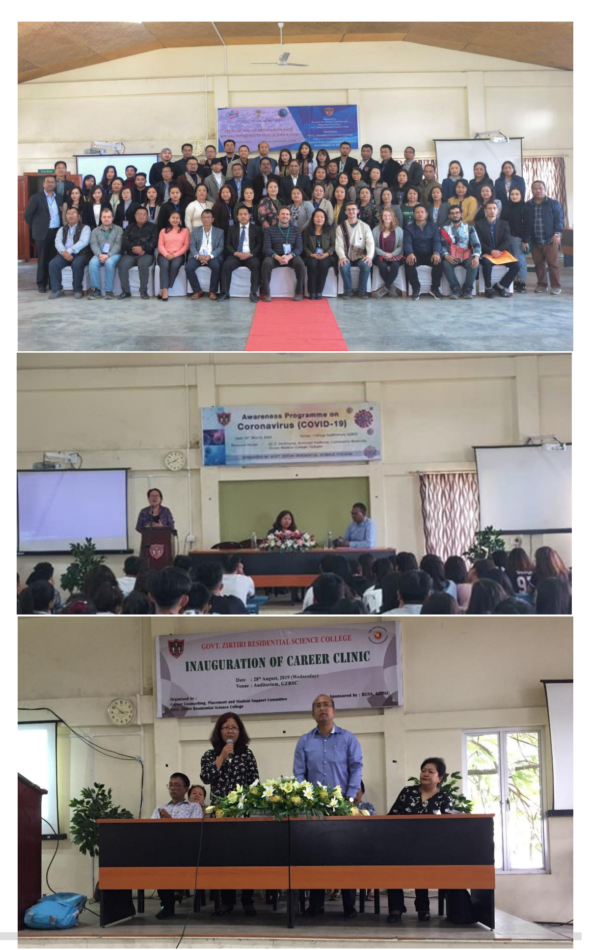
GOVT. ZIRTIRI RESIDENTIAL SCIENCE COLLEGE, AIZAWL, RAMTHAR